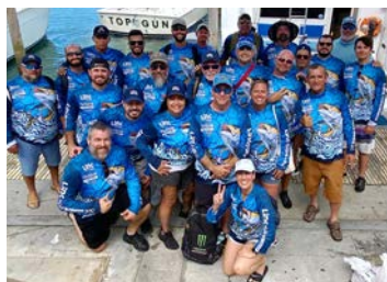
Link Fishing Challenge 2023