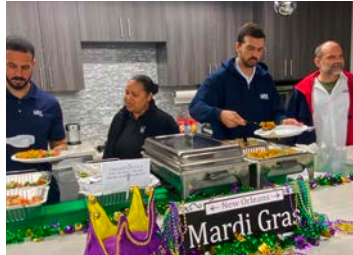
Mardi Gras Luncheon