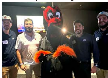
ABC Young Professionals at Miami Heat