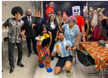
Link Halloween Luncheon