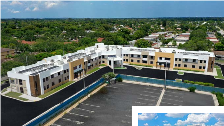
Parkside Memory Care Assisted Living Facility Tamarac, FL Architect: Cabrera Ramos Architects