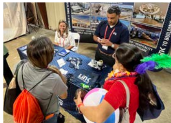
ABC Central FL Construction Expo