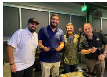
Link Top Golf Team Building Event