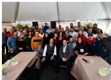
Link's End of Year Celebration