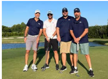
SFAGC Fall Golf Classic