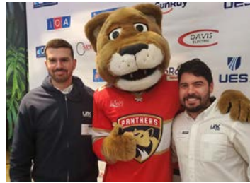
CASF Construction Night at the Panthers