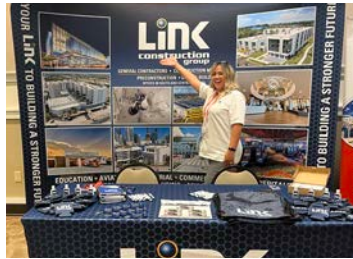
ABC Central FL GC Connect