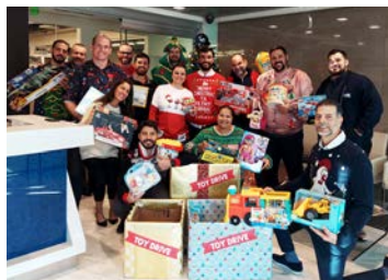
Ugly Sweater & Toy Drive Day