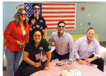
Link USA Freedom Luncheon