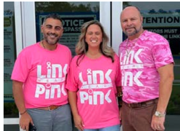
Link Wears Pink Breast Cancer Awareness