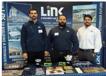
ABC East Coast Fall GC Showcase