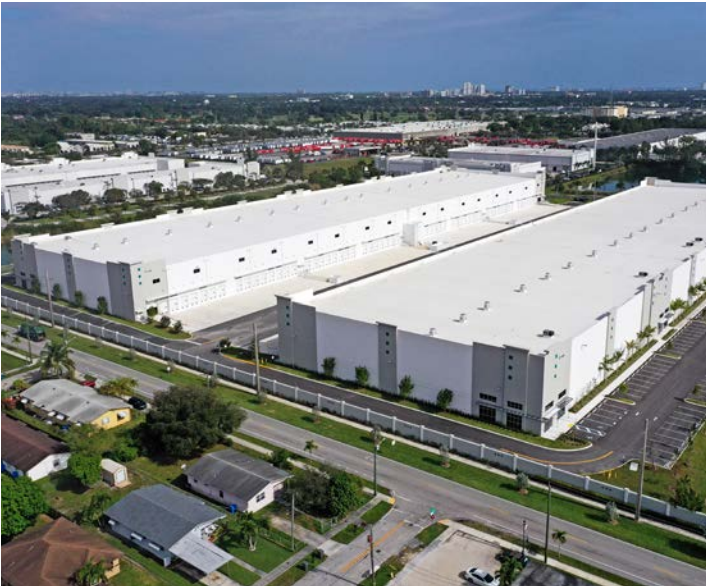
Seneca Commerce Center Buildings 2 & 3 Pembroke Park, FL Architect: Cabrera Ramos Architect, Inc.

Seneca Commerce Center Buildings 2 & 3, developed by Prologis in Broward County, are both ground-up, Class A tilt-panel warehouses built simultaneously. Both feature 36-foot high clear height, ESFR fire protection system, steel columns, joists, decks, and TPO roofing. Building 2 covers 190,495 SF with 22,859 SF of office space and 189 parking spaces. Building 3 spans 185,920 SF with 22,310 SF of office space and 164 parking spaces. Both buildings are located on a 22-acre site in Pembroke Park.