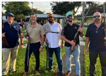
Miami Association of Realtors Pac Trap Tournament