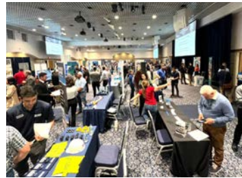
FIU Spring Career Expo