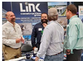
ABC East Coast Spring GC Showcase