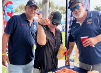
Christopher Columbus High School Family Picnic & Pig Roast