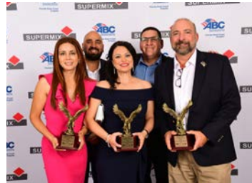
ABC East Coast EIC Awards