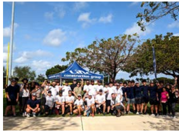
Kick CF Miami Kickball Tournament