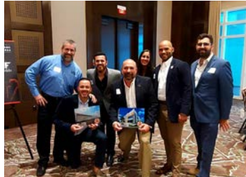
SFAGC Build Florida Awards