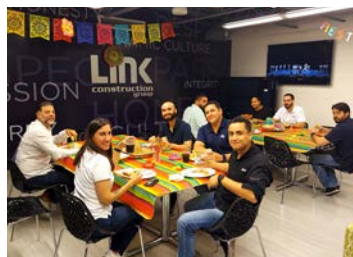
Cinco de Mayo Luncheon