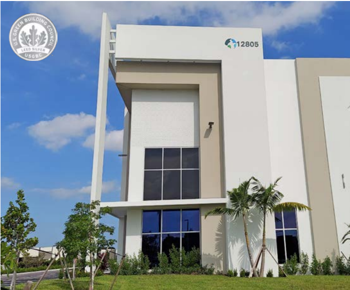
Prologis Gratigny 15 Industrial Park Opa-Locka, FL Architect: Arcadis Professional Services

The beautifully landscaped exterior includes terraces and a main entrance with a water feature. The facility uses natural gas and propane fuels and has an emergency generator capable of powering the entire facility.