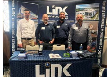
CASF Meet the GC Miami