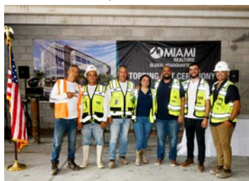
Miami Association of Realtors Topping Out Celebration